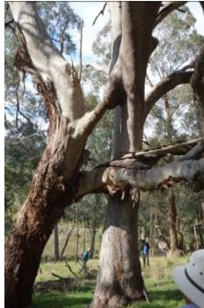
An example in nature how two are better than one. Seen at the recent Box-Gum Woodlands management day I attended in May.

We look forward to another year where this group can once again work together for the common good.