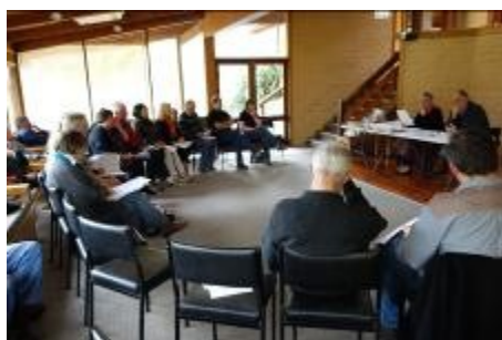
VLC Conference - Ovens 2014