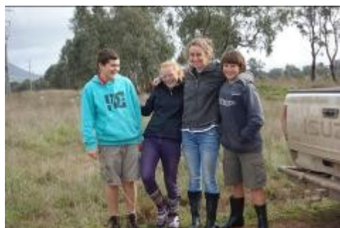
Agribusiness students helping out

The Community Bank Mansfield Branch is supporting the event which will host bike ride, walk or drive to the site and a warm BBQ lunch or soup post the event. All details are on the Up2Us website www.up2us.org.au . Give me a call if you need further information