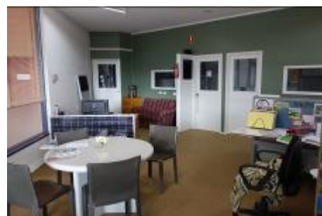
New look office - Feel free to drop in for a chat in our homely atmosphere