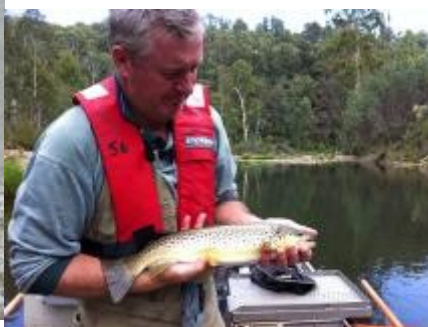
A researcher and a brown trout caught

http://www.depi.vic.gov.au/fishing-and-hunting/recreational-fishing/wild-trout-population-survey